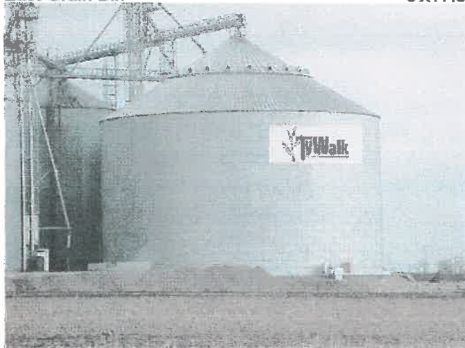
West Grain Bin

Proposed 16'x 35' Sign Digital Rendering