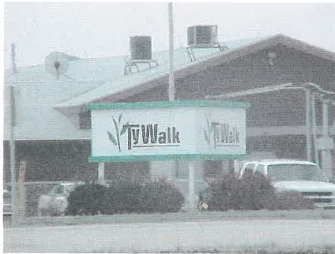
Front Yard, Freestanding Sign