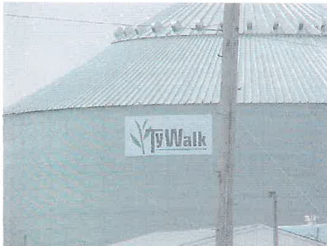
East Grain Bin