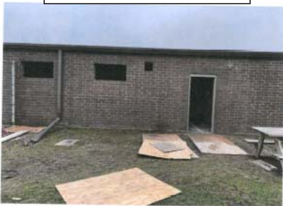
North Kennel Window & Door Openings