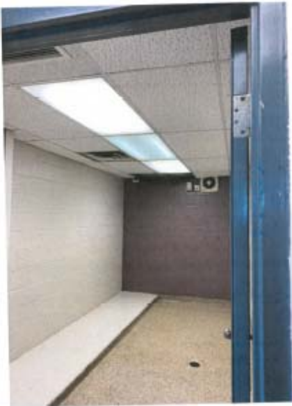
Director Office Before