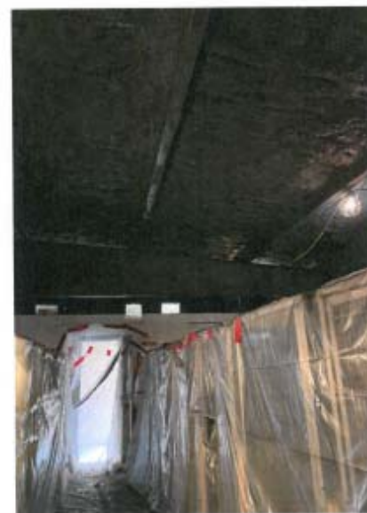
Kennel Black Ceiling