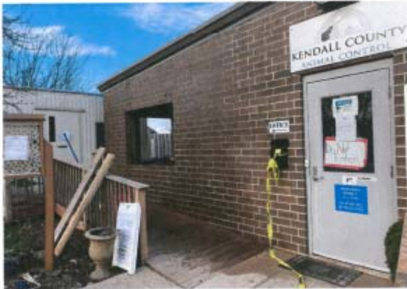
Director Office Windows