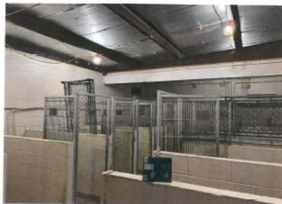
North Kennel Before