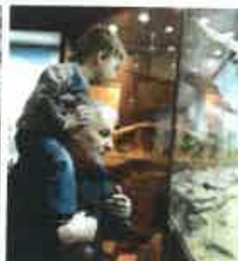
Nonprofit organizations such as museums, religious institutions, and civic groups