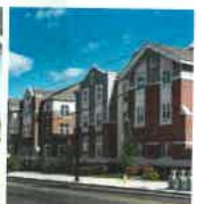
Housing and transportation authorities, ports and other special districts