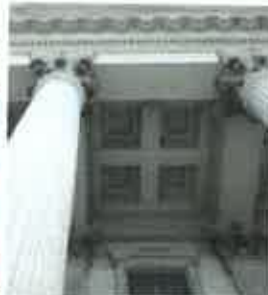
Cities, towns, counties, states, and other government entities