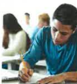
K-12 school districts and higher education

Many different types of government and nonprofit entities qualify to purchase through U.S. Communities.