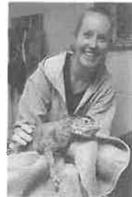
Renegade with his foster Mom