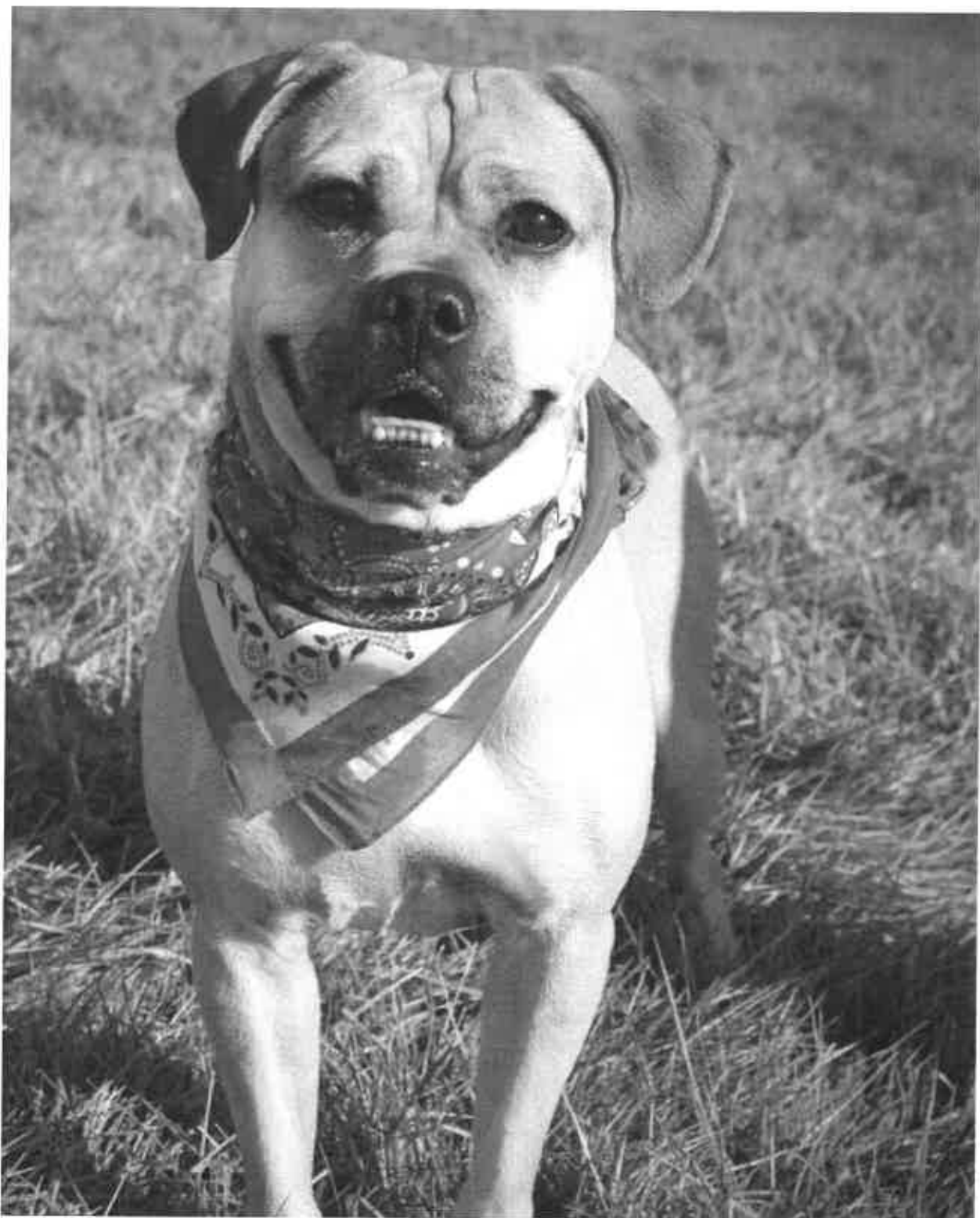
121 days "Luna" Breed: Puggle