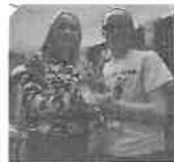
Basil going home