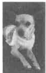
Piper at home in her new sweater