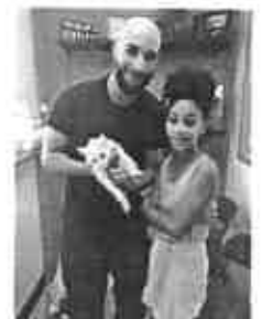
Lanie feeling so loved going to her forever home