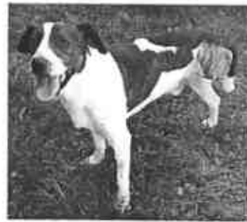
Charlie enjoying some exercise in our doggie play yard.

Charlie came from a home with children and is vaccinated, HW tested, micro-chipped and neutered.