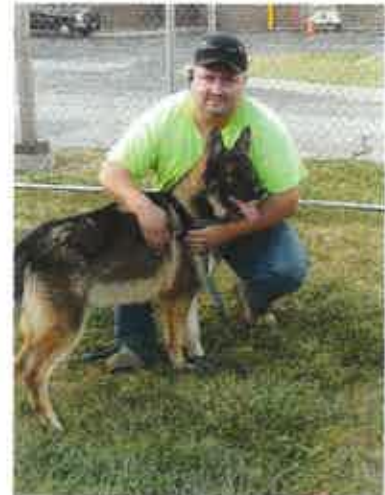
Sarge now "Kendall" with foster Dad

Update: Sarge's foster dad reports that Sarge has been adopted by a wonderful family who have renamed him "Kendall" in honor of Kendall County Animal Control.