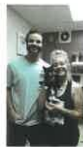
Zuko going to his forever home.

Wybert who has since been named "Isaac" going home with Mom and Dad.