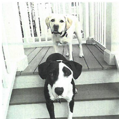
Pongo at his new home with his sister Harley.