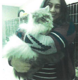
Goose going home with his new Mom