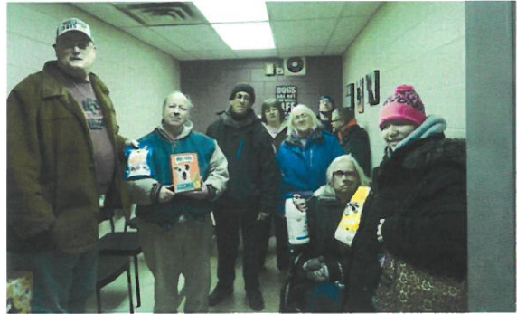
Big Thanks to the wonderful people at Open Door Rehabilitation in Sandwich for their generous donation of pet food, treats and cleaning supplies!