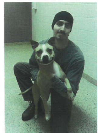
Martini and her new Dad are all smiles as they leave the shelter.