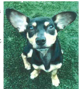
Romeo enjoying some green grass at the One Tail at a time Adoption Center.

For more information about adopting a pet from One tail at a Time, please visit: http://www.onetail.org/