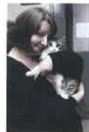
Mouse going home with his new Mom on May 12th.

Gopher's Mom brought him in for a little visit on June 7th.