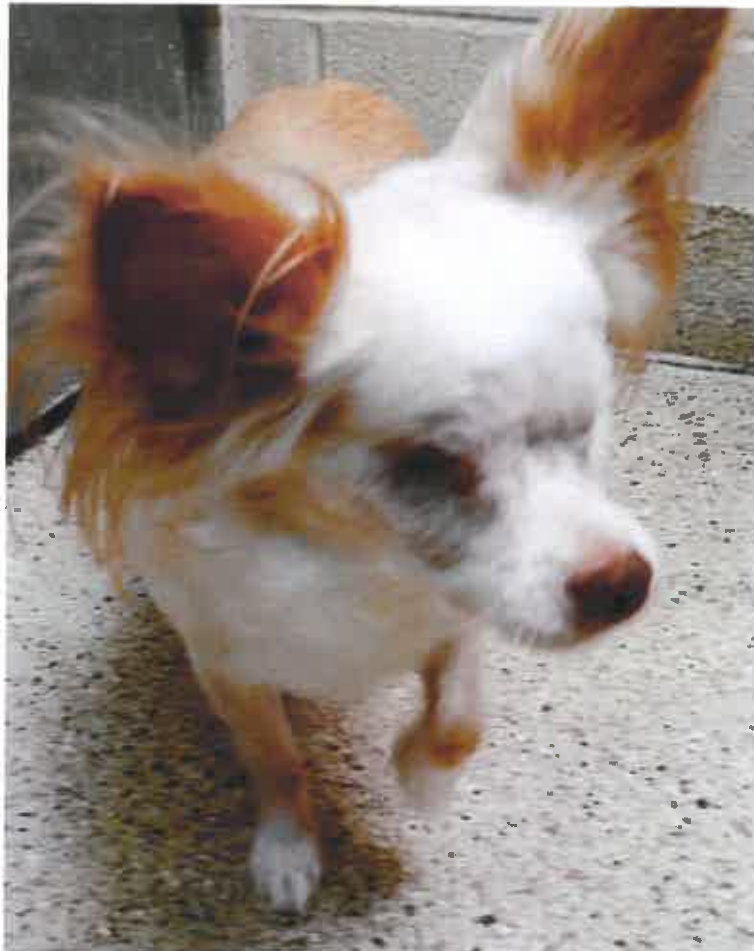
“Kady” After her surgery (enucleation) on 5/26/16