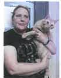
Hudson is thrilled to be going to a home where he will get lots of love!