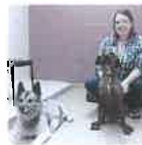
Dixie going to her forever home with her Mom