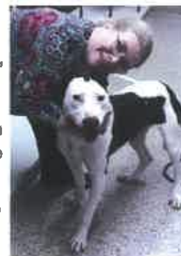
Penny and Shorty