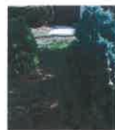
Pictured above— some of the landscaping completed by Eagle Scouts Troop 12