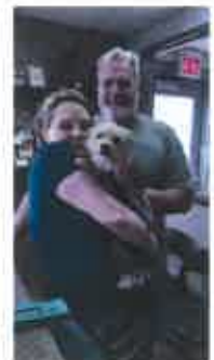
Ajax going to his forever home.