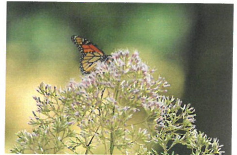
Monarch butterfly, Hackmatack National Wildlife Refuge, McHenry County.

Examples of demonstrable benefits for pollinator conservation include, but are not limited to, projects that 1) establish or enhance pollinator habitat, and 2) incorporate interpretation components, such as educational site signage, that inform the public about pollinators and pollinator conservation.