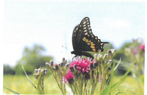
Tiger swallowtail butterfly, Midewin National Tallgrass Prairie, Joliet.

Pollinator species – such as bees, butterflies, bats, and birds – play important roles in the reproduction of flowering plants, including crops that people depend on for food. In Illinois alone, more than 2,500 species of bees, butterflies, and moths contribute to this vital ecological service. Yet over the past few decades, threats posed by habitat loss, disease, parasites, climate change, and environmental contaminants have all contributed to the global decline of many pollinator species.