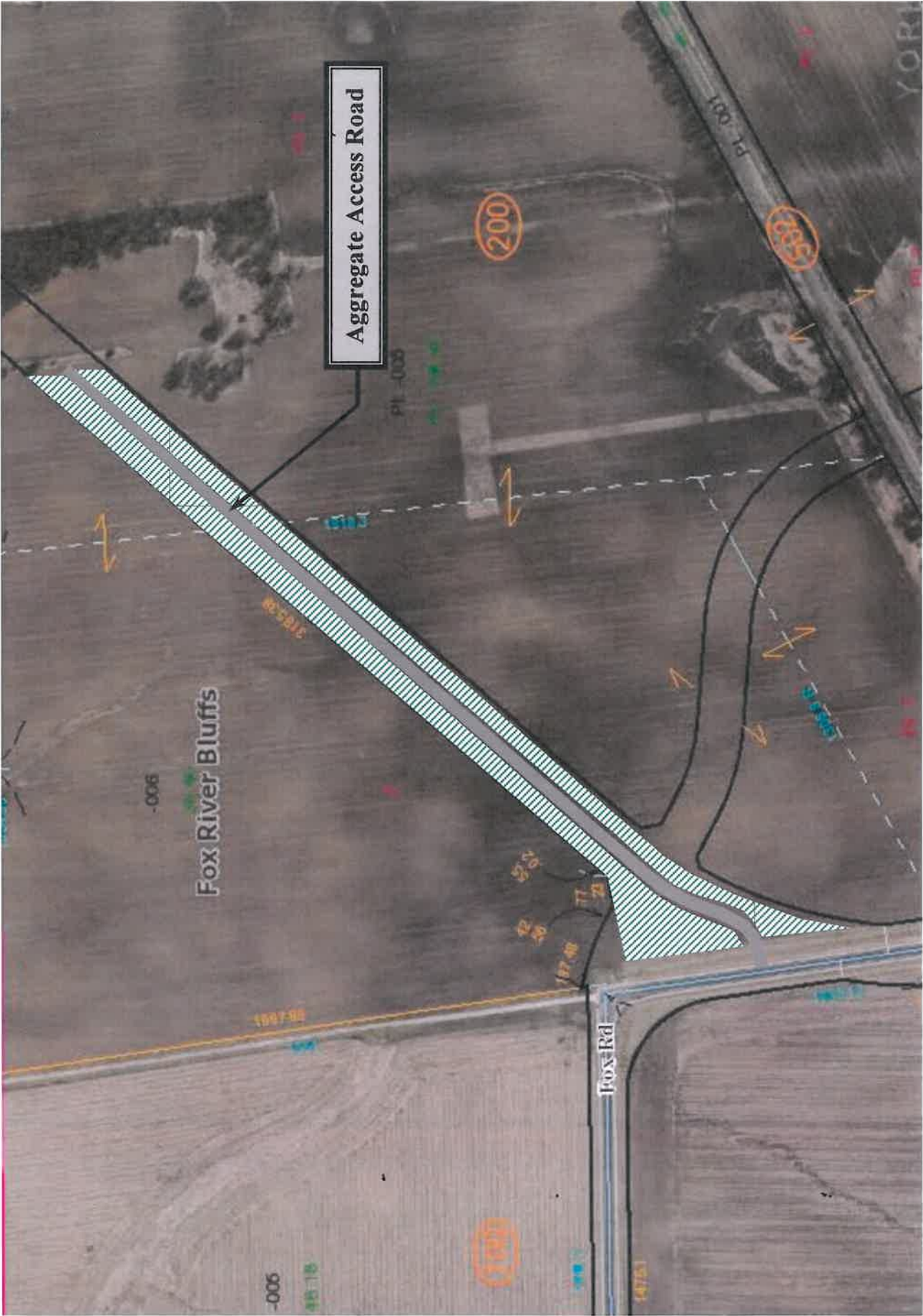
Farm Lease for Grass/Alfalfa Mix ±7 Acres