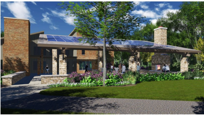
Exterior Patio View with Roof Structure

Kendall County Forest Preserve – Pickerill Estate House Conversion