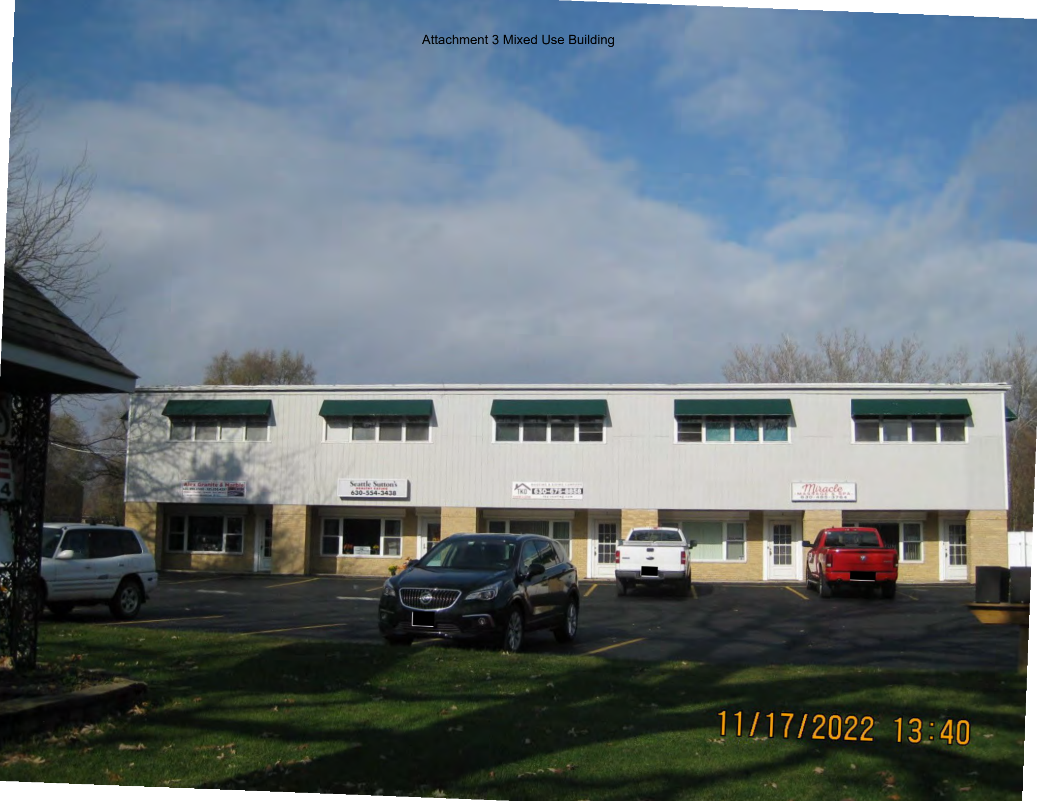
Attachment 3 Mixed Use Building