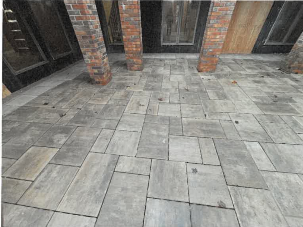
FIELD OBSERVATION PHOTO