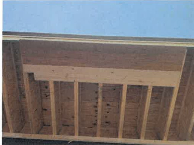
FIELD OBSERVATION PHOTO

CLIENT: Kendall County Forest Preserve District PROJECT: Pickerill Estate Renovations PROJECT NO. 1250/1371