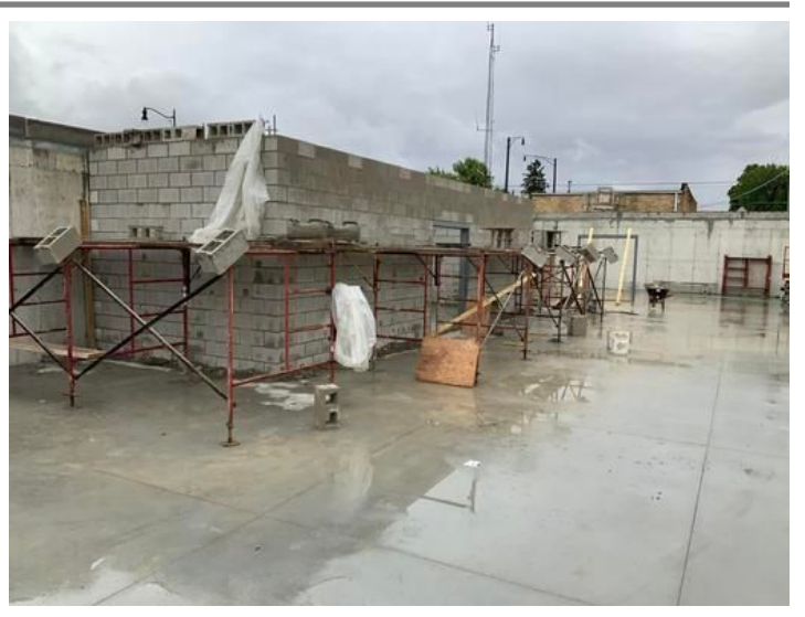
IMG_0380 Taken on Oct 6, 2023, 2:44 PM CDT Added on Oct 6, 2023, 3:02 PM CDT Added by Ken Gleason