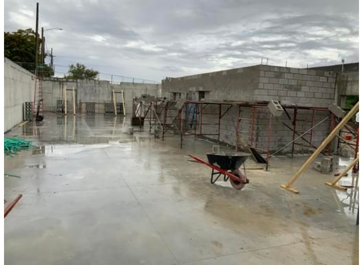
IMG_0381 Taken on Oct 6, 2023, 2:45 PM CDT Added on Oct 6, 2023, 3:02 PM CDT Added by Ken Gleason