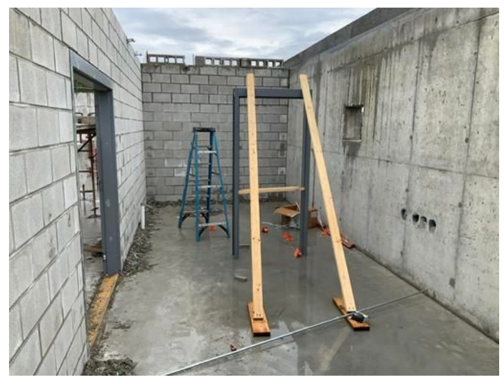
IMG_0378 Taken on Oct 6, 2023, 2:43 PM CDT Added on Oct 6, 2023, 3:02 PM CDT Added by Ken Gleason