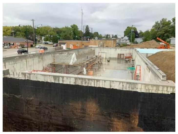
IMG_0382 Taken on Oct 6, 2023, 2:47 PM CDT Added on Oct 6, 2023, 3:02 PM CDT Added by Ken Gleason