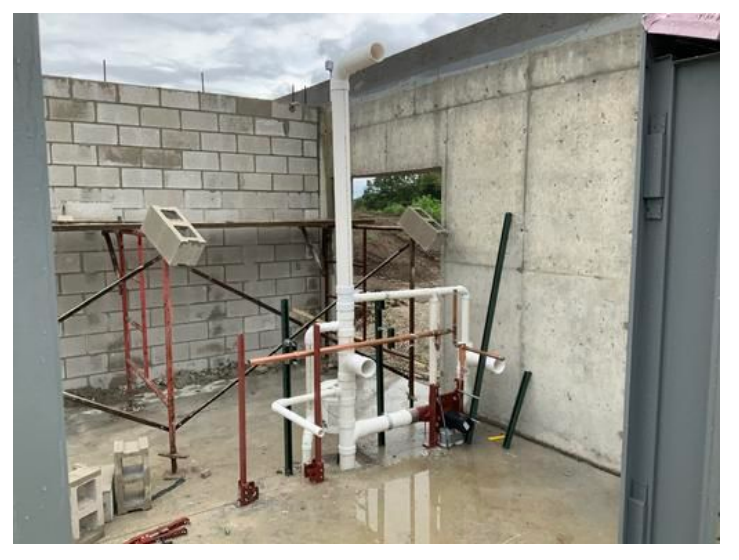
IMG_0376 Taken on Oct 6, 2023, 2:42 PM CDT Added on Oct 6, 2023, 3:02 PM CDT Added by Ken Gleason