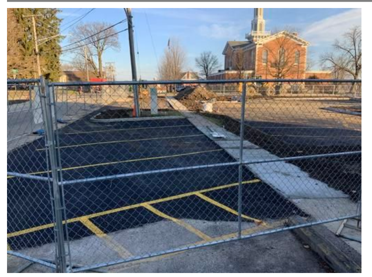
IMG_0791 Taken on Dec 8, 2023, 8:22 AM CST Added on Dec 8, 2023, 1:52 PM CST Added by Ken Gleason