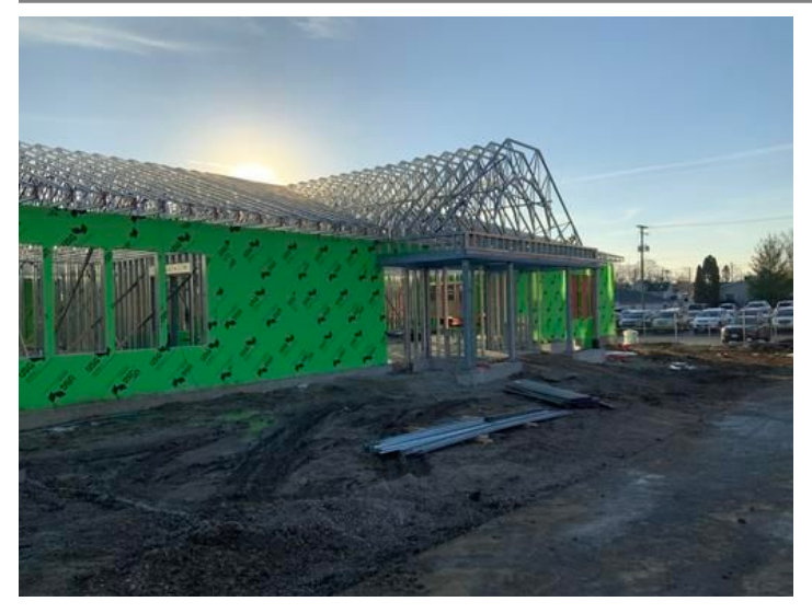
IMG_0796 Taken on Dec 8, 2023, 8:24 AM CST Added on Dec 8, 2023, 1:52 PM CST Added by Ken Gleason