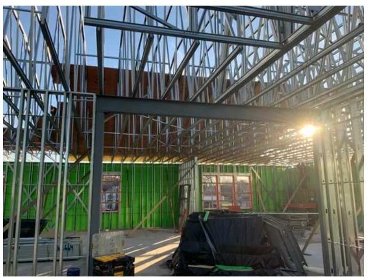
IMG_0797 Taken on Dec 8, 2023, 8:25 AM CST Added on Dec 8, 2023, 1:52 PM CST Added by Ken Gleason