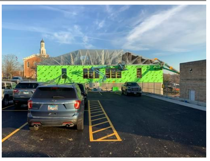
IMG_0789 Taken on Dec 8, 2023, 8:11 AM CST Added on Dec 8, 2023, 1:52 PM CST Added by Ken Gleason