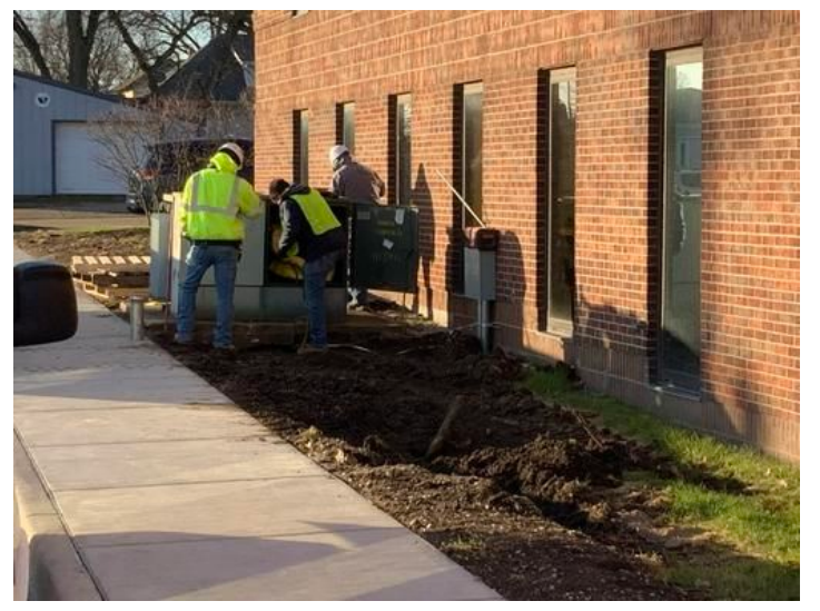
IMG_0798 Taken on Dec 8, 2023, 8:27 AM CST Added on Dec 8, 2023, 1:52 PM CST Added by Ken Gleason