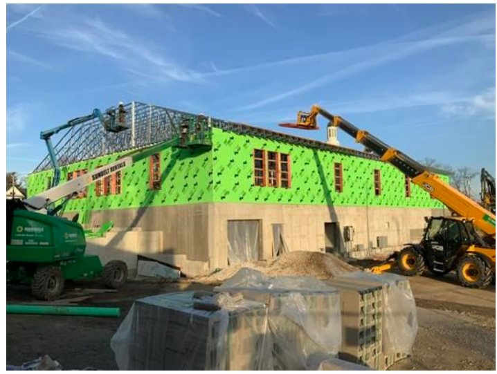
IMG_0788 Taken on Dec 8, 2023, 8:10 AM CST Added on Dec 8, 2023, 1:52 PM CST Added by Ken Gleason