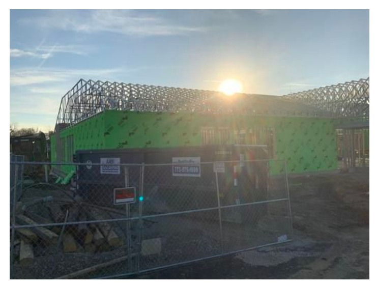
IMG_0795 Taken on Dec 8, 2023, 8:24 AM CST Added on Dec 8, 2023, 1:52 PM CST Added by Ken Gleason