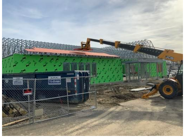
IMG_0799 Taken on Dec 8, 2023, 11:42 AM CST Added on Dec 8, 2023, 1:52 PM CST Added by Ken Gleason