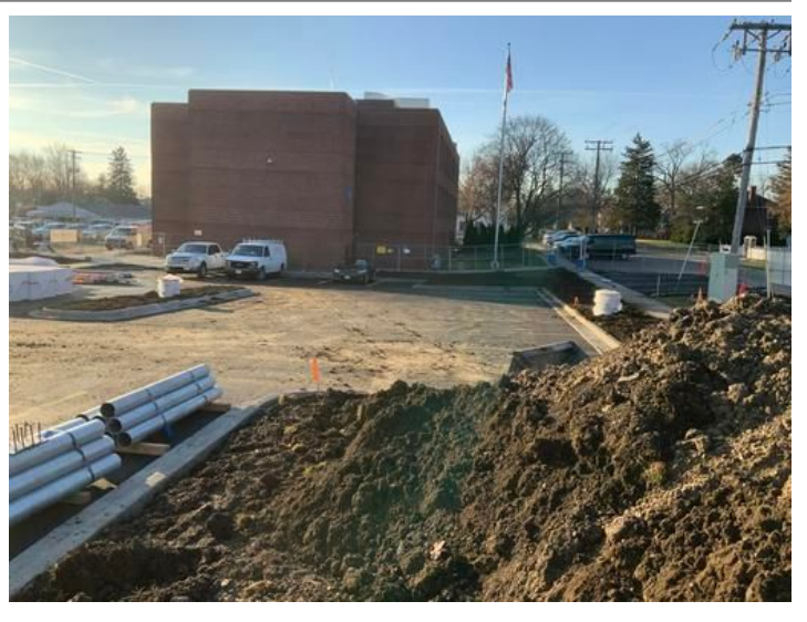
IMG_0794 Taken on Dec 8, 2023, 8:24 AM CST Added on Dec 8, 2023, 1:52 PM CST Added by Ken Gleason