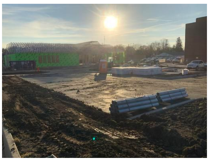
IMG_0793 Taken on Dec 8, 2023, 8:23 AM CST Added on Dec 8, 2023, 1:52 PM CST Added by Ken Gleason