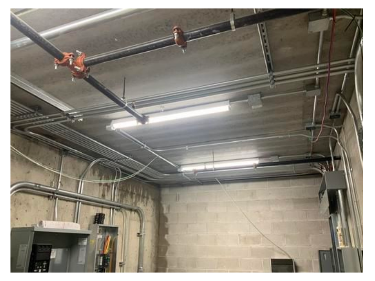
IMG_0961 Taken on Jan 19, 2024, 9:29 AM CST Added on Jan 19, 2024, 10:31 AM CST