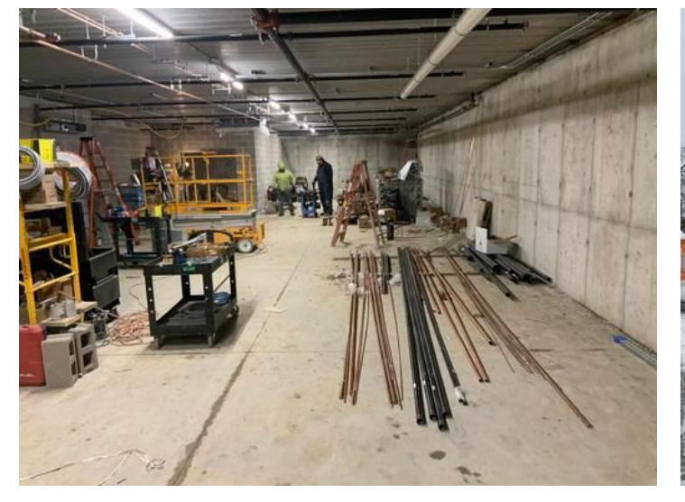
IMG_0958 Taken on Jan 19, 2024, 9:27 AM CST Added on Jan 19, 2024, 10:32 AM CST