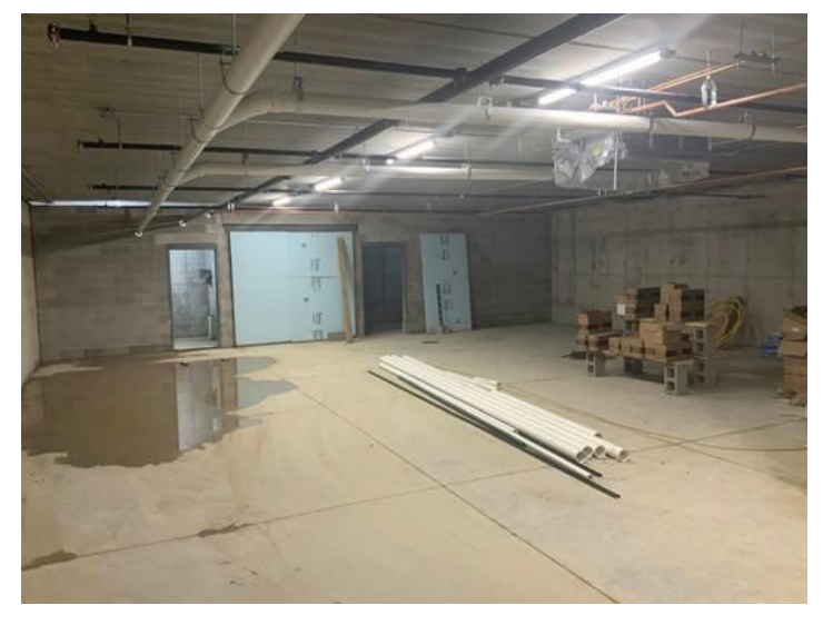
IMG_1072 Taken on Feb 2, 2024, 8:56 AM CST Added on Feb 2, 2024, 9:33 AM CST Added by Ken Gleason