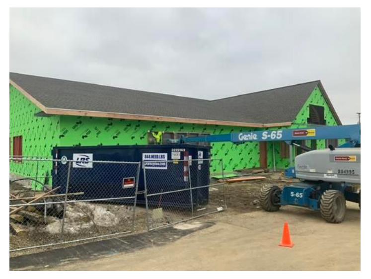
IMG_1067 Taken on Feb 2, 2024, 8:37 AM CST Added on Feb 2, 2024, 9:33 AM CST Added by Ken Gleason