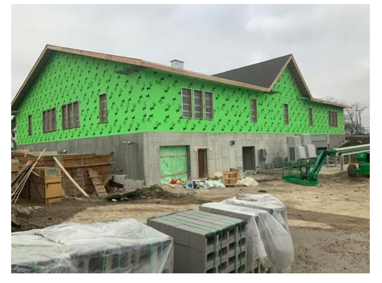
IMG_1065 Taken on Feb 2, 2024, 8:35 AM CST Added on Feb 2, 2024, 9:33 AM CST Added by Ken Gleason