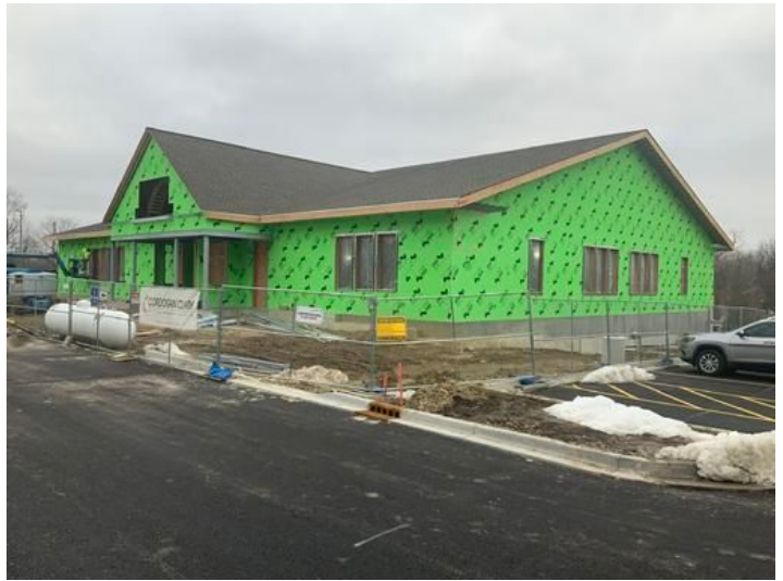
IMG_1066 Taken on Feb 2, 2024, 8:36 AM CST Added on Feb 2, 2024, 9:33 AM CST Added by Ken Gleason