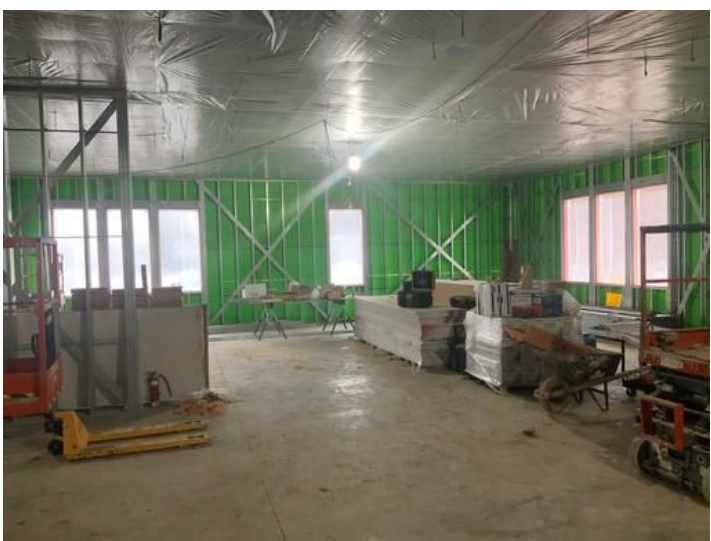
IMG_1068 Taken on Feb 2, 2024, 8:50 AM CST Added on Feb 2, 2024, 9:33 AM CST Added by Ken Gleason