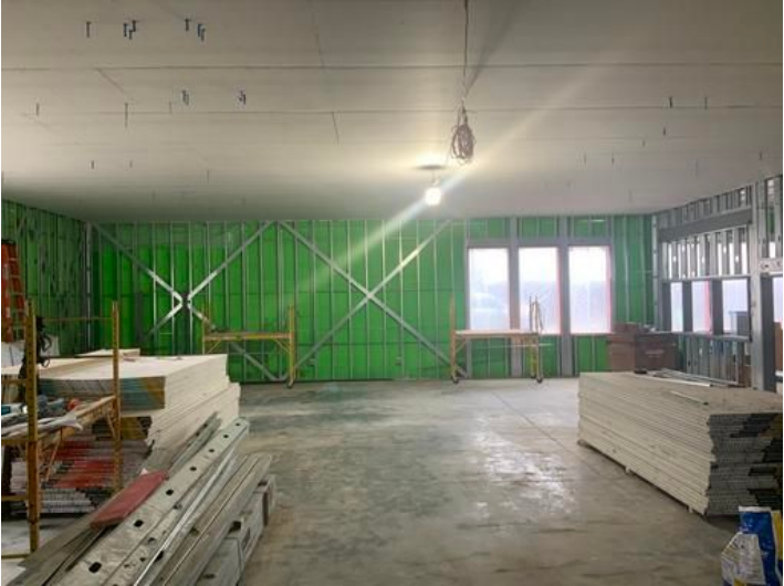
IMG_1071 Taken on Feb 2, 2024, 8:51 AM CST Added on Feb 2, 2024, 9:33 AM CST Added by Ken Gleason