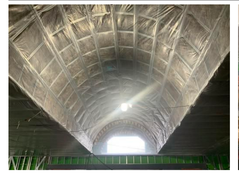
IMG_1069 Taken on Feb 2, 2024, 8:50 AM CST Added on Feb 2, 2024, 9:33 AM CST Added by Ken Gleason