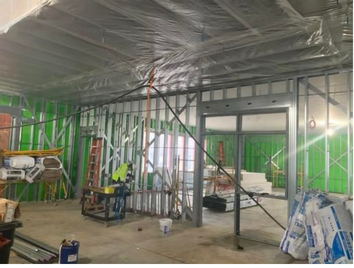
IMG_1070 Taken on Feb 2, 2024, 8:50 AM CST Added on Feb 2, 2024, 9:33 AM CST Added by Ken Gleason