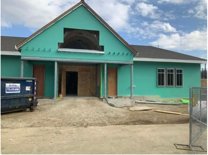
IMG_1257 Taken on Feb 23, 2024, 1:38 PM CST Added on Feb 23, 2024, 2:42 PM CST