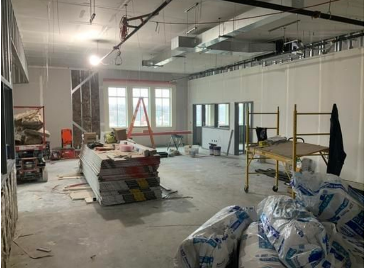
IMG_1262 Taken on Feb 23, 2024, 2:08 PM CST Added on Feb 23, 2024, 2:42 PM CST

22-1071 (BUILD) Kendall County PH1 Clerk Building