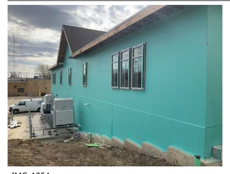
IMG_1254 Taken on Feb 23, 2024, 1:35 PM CST Added on Feb 23, 2024, 2:42 PM CST