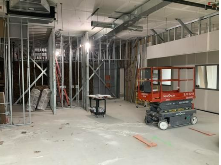
IMG_1267 Taken on Feb 23, 2024, 2:10 PM CST Added on Feb 23, 2024, 2:42 PM CST Added by Ken Gleason