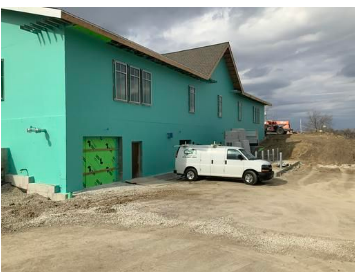
IMG_1253 Taken on Feb 23, 2024, 1:34 PM CST Added on Feb 23, 2024, 2:42 PM CST