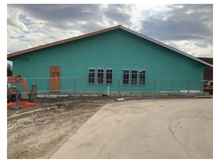
IMG_1255 Taken on Feb 23, 2024, 1:37 PM CST Added on Feb 23, 2024, 2:42 PM CST Added by Ken Gleason