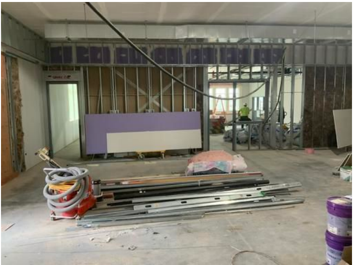
IMG_1260 Taken on Feb 23, 2024, 2:07 PM CST Added on Feb 23, 2024, 2:42 PM CST Added by Ken Gleason