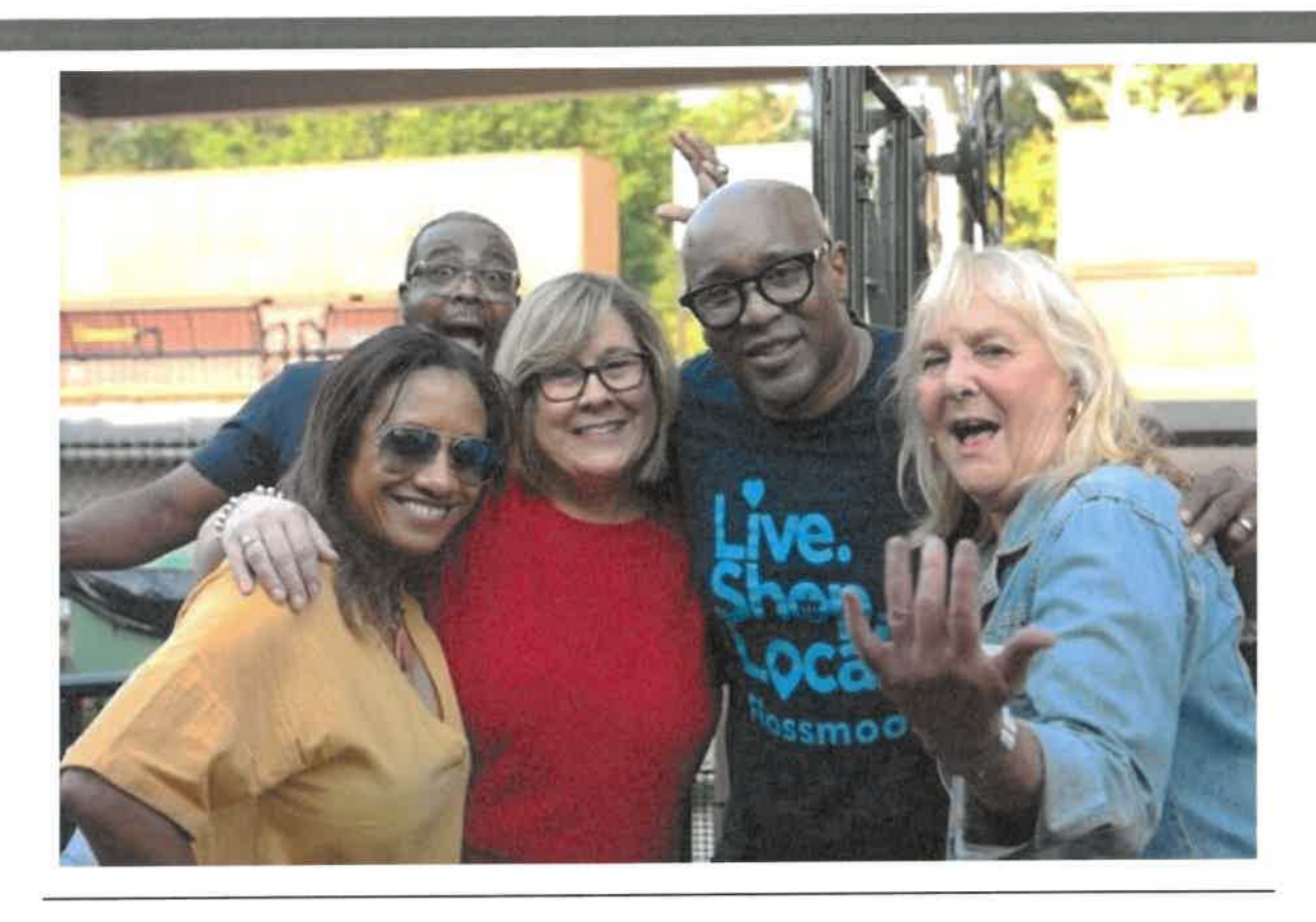
TRANSFORM through education, exploration, and discovery.