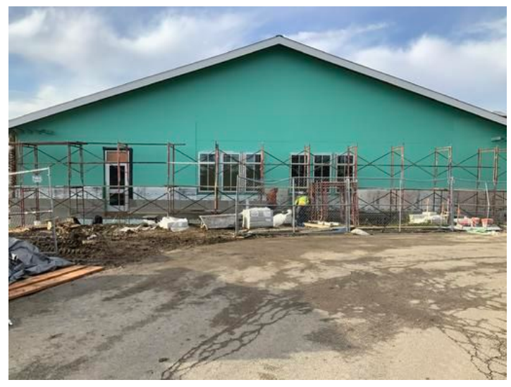
IMG_1648 Taken on Apr 12, 2024, 8:14 AM CDT Added on Apr 12, 2024, 12:50 PM CDT Added by Ken Gleason