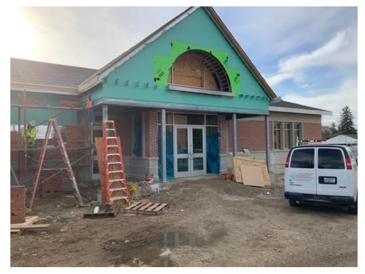
IMG_1650 Taken on Apr 12, 2024, 8:15 AM CDT Added on Apr 12, 2024, 12:50 PM CDT Added by Ken Gleason