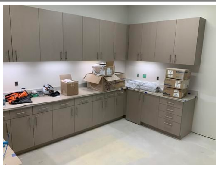
IMG_1656 Taken on Apr 12, 2024, 8:20 AM CDT Added on Apr 12, 2024, 12:50 PM CDT Added by Ken Gleason