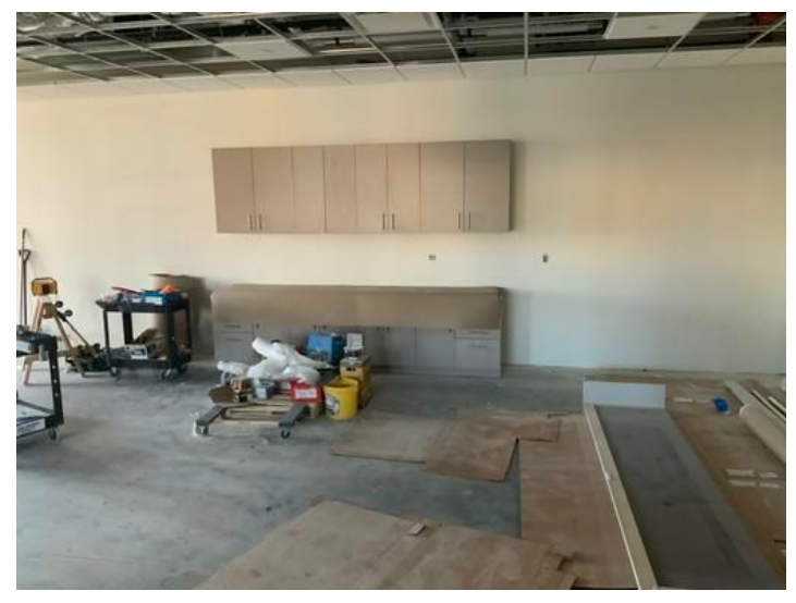
IMG_1657 Taken on Apr 12, 2024, 8:22 AM CDT Added on Apr 12, 2024, 12:50 PM CDT Added by Ken Gleason