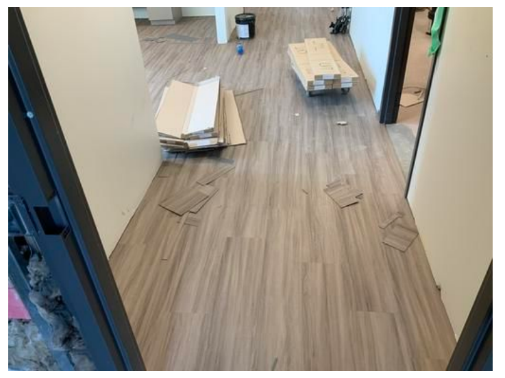
IMG_1661 Taken on Apr 12, 2024, 12:47 PM CDT Added on Apr 12, 2024, 12:50 PM CDT