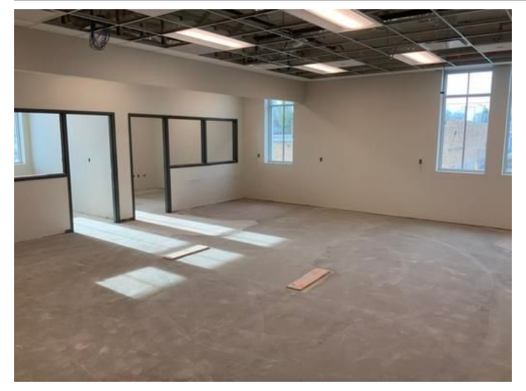
IMG_1653 Taken on Apr 12, 2024, 8:17 AM CDT Added on Apr 12, 2024, 12:50 PM CDT Added by Ken Gleason