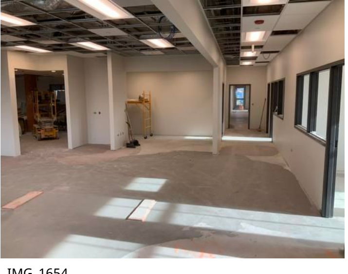
IMG_1654 Taken on Apr 12, 2024, 8:20 AM CDT Added on Apr 12, 2024, 12:50 PM CDT Added by Ken Gleason