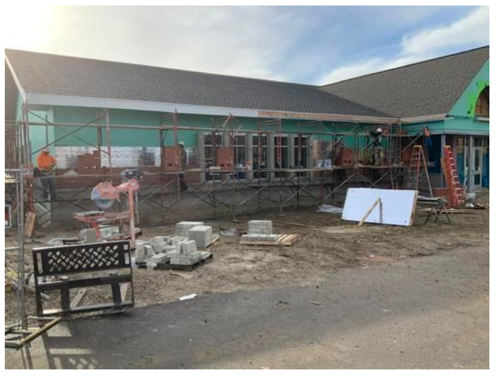
IMG_1649 Taken on Apr 12, 2024, 8:15 AM CDT Added on Apr 12, 2024, 12:50 PM CDT Added by Ken Gleason