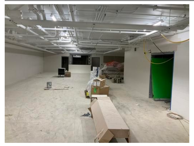
IMG_1659 Taken on Apr 12, 2024, 12:46 PM CDT Added on Apr 12, 2024, 12:50 PM CDT