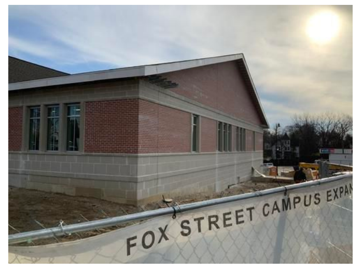
IMG_1652 Taken on Apr 12, 2024, 8:16 AM CDT Added on Apr 12, 2024, 12:50 PM CDT Added by Ken Gleason