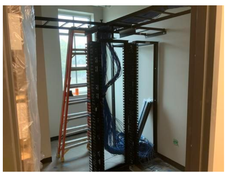
IMG_1769 Taken on Apr 26, 2024, 1:09 PM CDT Added on Apr 26, 2024, 1:24 PM CDT Added by Ken Gleason