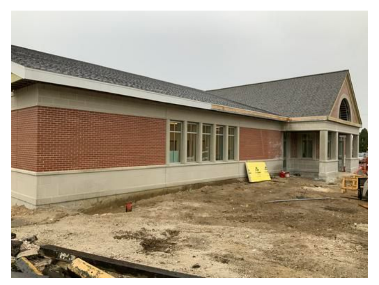
IMG_1778 Taken on Apr 26, 2024, 1:17 PM CDT Added on Apr 26, 2024, 1:23 PM CDT