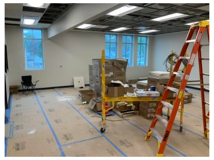
IMG_1770 Taken on Apr 26, 2024, 1:09 PM CDT Added on Apr 26, 2024, 1:24 PM CDT Added by Ken Gleason