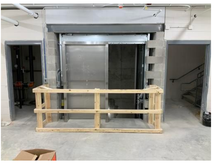
IMG_1764 Taken on Apr 26, 2024, 1:08 PM CDT Added on Apr 26, 2024, 1:24 PM CDT Added by Ken Gleason