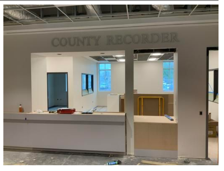
IMG_1775 Taken on Apr 26, 2024, 1:12 PM CDT Added on Apr 26, 2024, 1:24 PM CDT Added by Ken Gleason