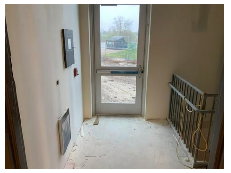
IMG_1767 Taken on Apr 26, 2024, 1:09 PM CDT Added on Apr 26, 2024, 1:24 PM CDT Added by Ken Gleason