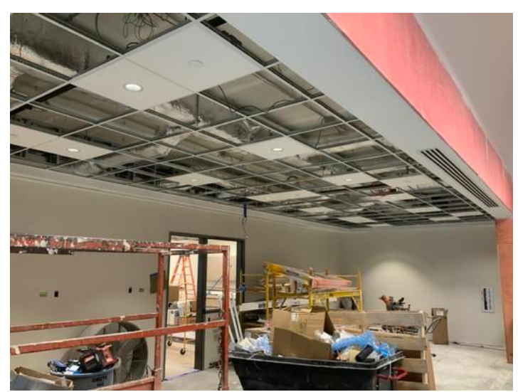
IMG_1773 Taken on Apr 26, 2024, 1:11 PM CDT Added on Apr 26, 2024, 1:23 PM CDT