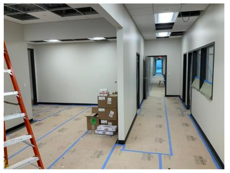
IMG_1771 Taken on Apr 26, 2024, 1:10 PM CDT Added on Apr 26, 2024, 1:24 PM CDT