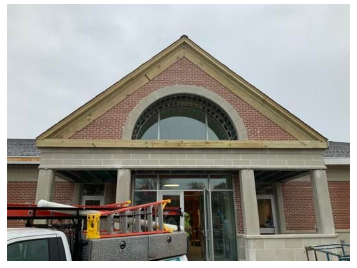
IMG_1779 Taken on Apr 26, 2024, 1:17 PM CDT Added on Apr 26, 2024, 1:23 PM CDT