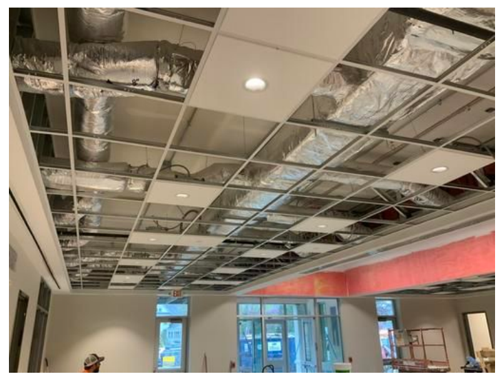
IMG_1774 Taken on Apr 26, 2024, 1:12 PM CDT Added on Apr 26, 2024, 1:23 PM CDT