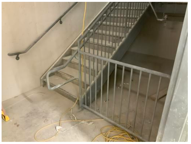
IMG_1766 Taken on Apr 26, 2024, 1:08 PM CDT Added on Apr 26, 2024, 1:24 PM CDT Added by Ken Gleason