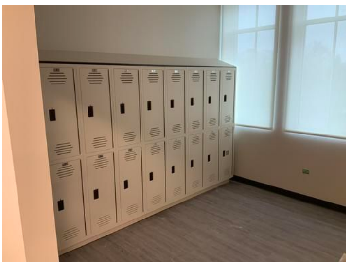
IMG_1768 Taken on Apr 26, 2024, 1:09 PM CDT Added on Apr 26, 2024, 1:24 PM CDT Added by Ken Gleason