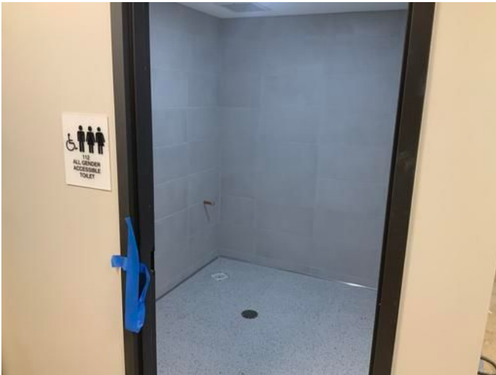
First Floor Bath Wall Tile Taken on May 10, 2024, 1:04 PM CDT Added on May 10, 2024, 1:17 PM CDT Added by Ken Gleason