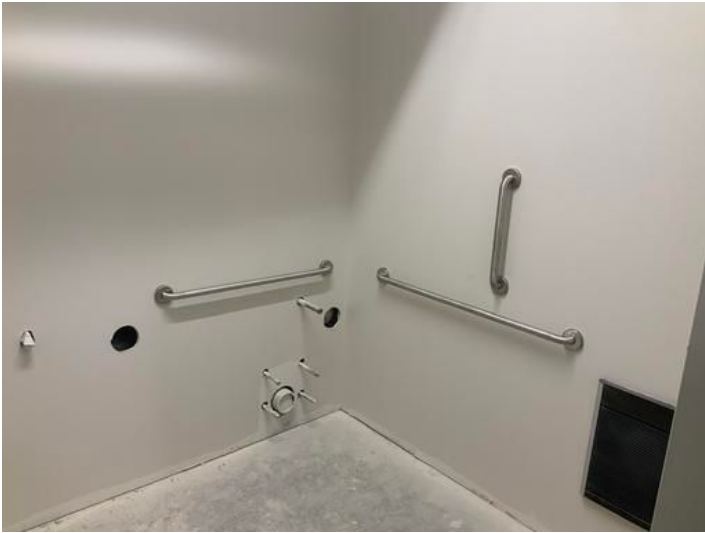
Basement Bathroom Grab Bars Taken on May 9, 2024, 2:53 PM CDT Added on May 10, 2024, 1:17 PM CDT Added by Ken Gleason