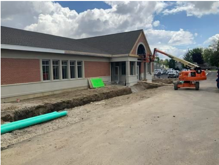
Front Entry Flat Roof Taken on May 10, 2024, 12:58 PM CDT Added on May 10, 2024, 1:17 PM CDT Added by Ken Gleason