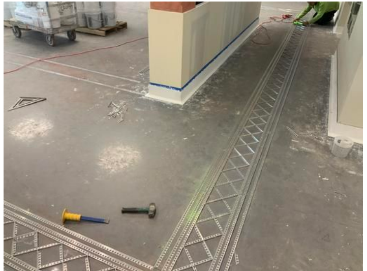
Lobby Terrazzo Tracks Taken on May 10, 2024, 1:03 PM CDT Added on May 10, 2024, 1:18 PM CDT Added by Ken Gleason