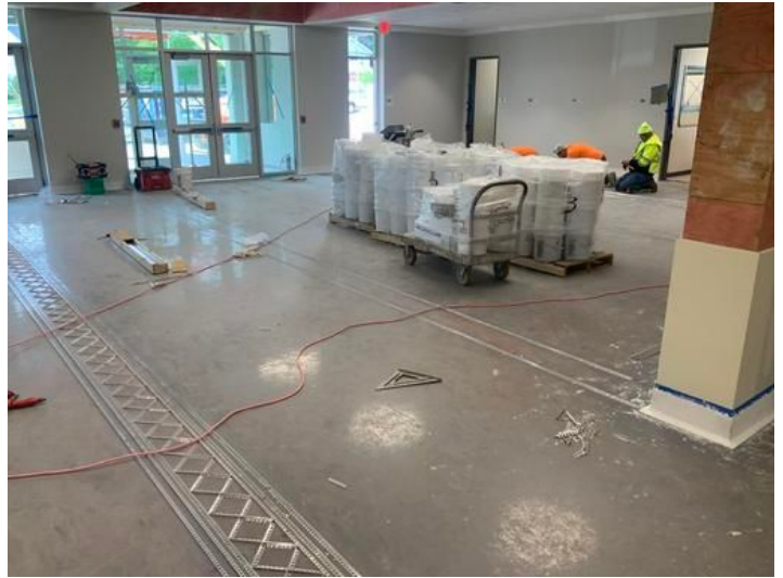
Lobby Terrazzo Tracks Taken on May 10, 2024, 1:03 PM CDT Added on May 10, 2024, 1:17 PM CDT Added by Ken Gleason