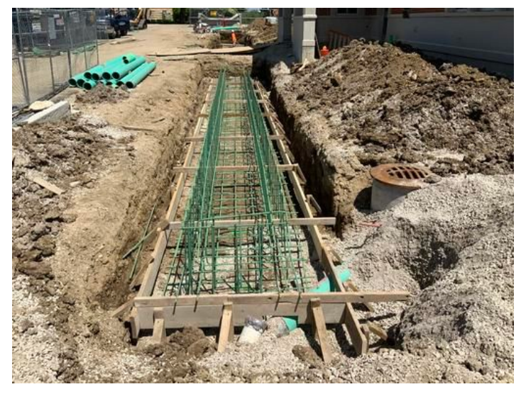
Planter Boxes West Side Taken on May 17, 2024, 12:07 PM CDT Added on May 17, 2024, 4:08 PM CDT Added by Ken Gleason