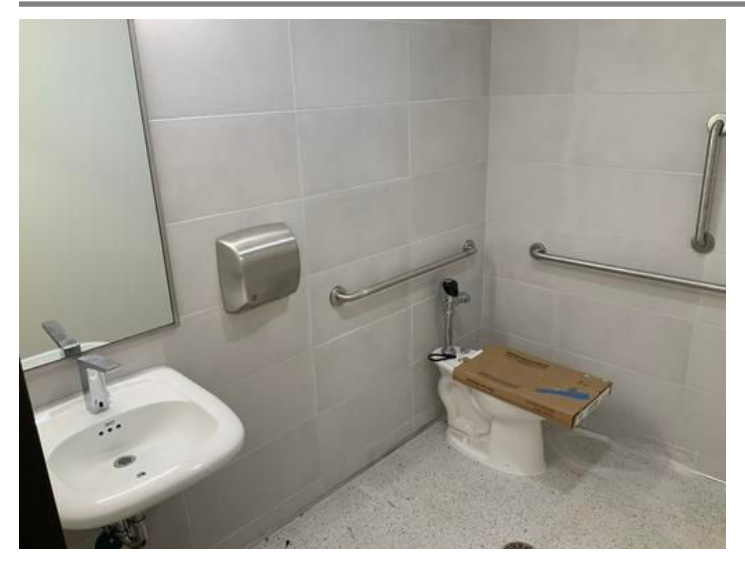
First Floor Bathrooms Taken on May 17, 2024, 12:14 PM CDT Added on May 17, 2024, 4:08 PM CDT