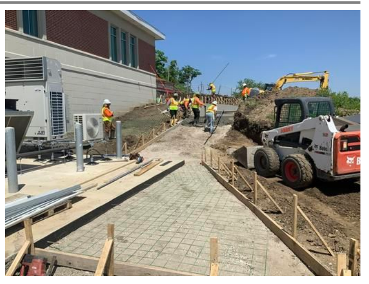
Drive Pad East Side Taken on May 17, 2024, 12:05 PM CDT Added on May 17, 2024, 4:08 PM CDT