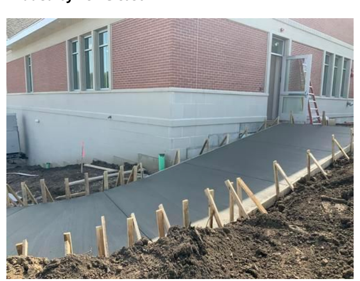
Drive Pad NE Corner Taken on May 17, 2024, 3:59 PM CDT Added on May 17, 2024, 4:08 PM CDT