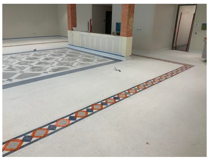
Lobby Terrazzo Flooring Taken on May 24, 2024, 9:40 AM CDT Added on May 24, 2024, 1:29 PM CDT