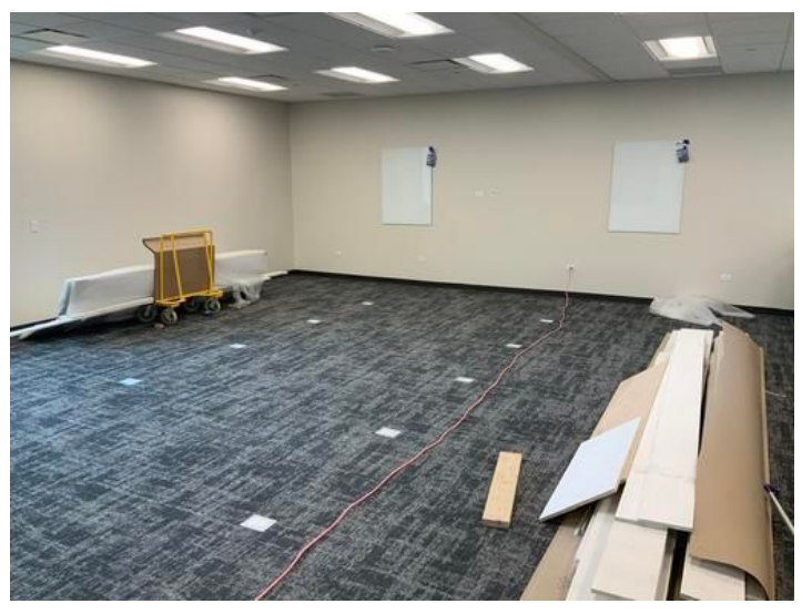
Voter Registration/Training Taken on May 24, 2024, 9:42 AM CDT Added on May 24, 2024, 1:29 PM CDT