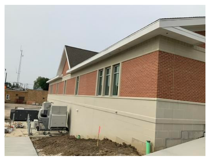
Exterior NE Corner Taken on May 24, 2024, 9:26 AM CDT Added on May 24, 2024, 1:29 PM CDT