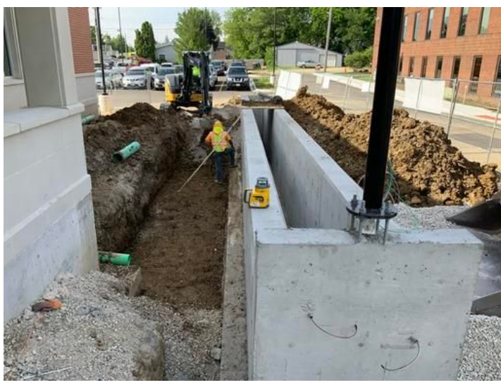
Planter box & excavation Taken on May 31, 2024, 8:25 AM CDT Added on May 31, 2024, 3:41 PM CDT