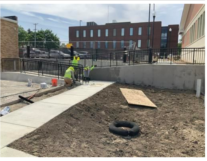
Rubbed finish install at ADA ramp Taken on May 31, 2024, 3:26 PM CDT Added on May 31, 2024, 3:41 PM CDT