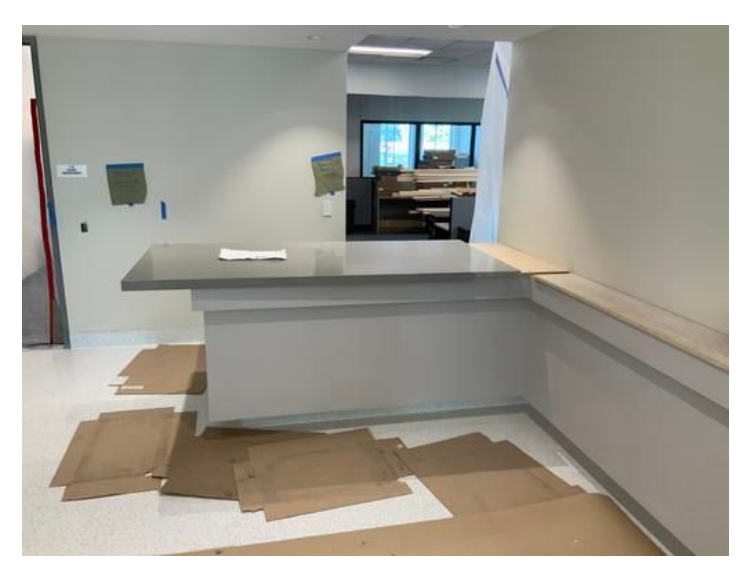
Countertop install at lobby Taken on May 31, 2024, 3:17 PM CDT Added on May 31, 2024, 3:41 PM CDT