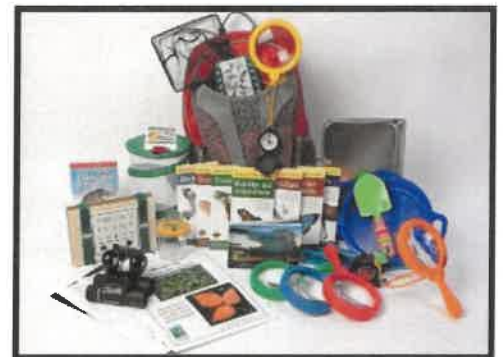
Field Trip Pack

Contact the Kendall County Forest Preserve District Education Department at KCFPDeducation@kendallcountyil.gov , or call (630) 553-2292 to check availability and schedule pickup.