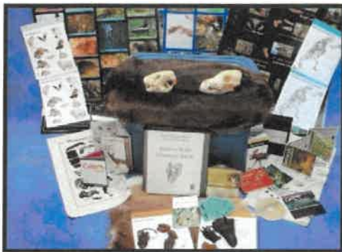
Illinois Wild Mammals Trunk

Teachers are able to check out the following materials from the District's main office located at 110 W. Madison Street in Yorkville: