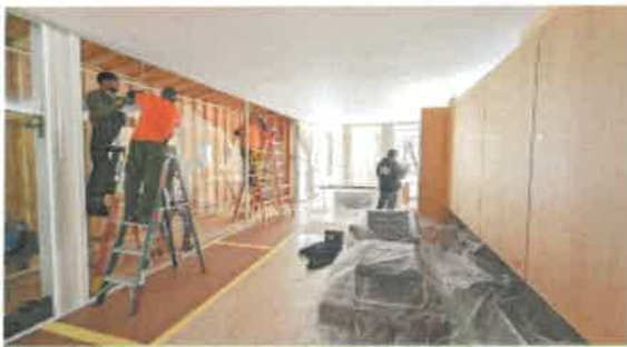
Above: Eight of the original non-tempered glass panes were replaced with new tempered glass, and the original steel frames were reconditioned and reinstalled

P.O. Box 194 • 14520 River Road • Plano IL 60545 • 630.552.0052 farnsworth@farnsworthhouse.org • edithfarnsworthhouse.org