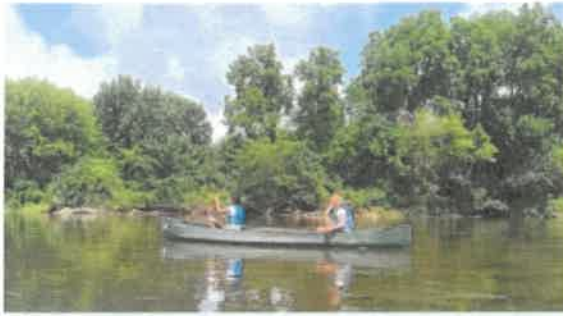
Above: This summer, we offered guided river trips in partnership with the Kendall County Outdoor Education Center