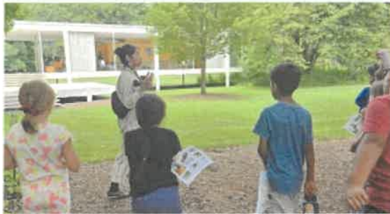
Below: West Chicago CAPE Summer Program with the Mexican Cultural Center DuPage

Please consider a year-end gift in support of the