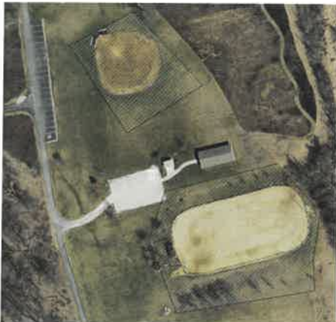
Harris Forest Preserve Horse Arena and Ballfield