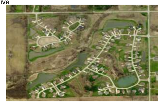
Conservation Design Suburban Density