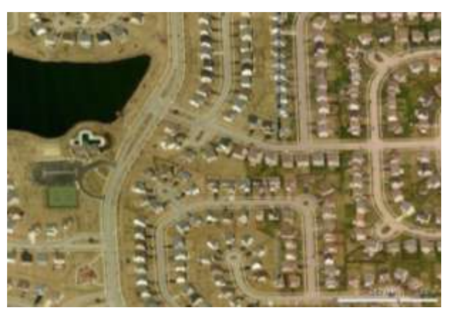
Conventional Suburban Residential Design

residences. This land use is consistent with the County's RPD-3 zoning district, permitting a base density of 0.86 du/ac and a maximum density of 1.0 du/ac. Higher municipal densities are appropriate on lots where adequate public sewer and water systems exist or can be made available